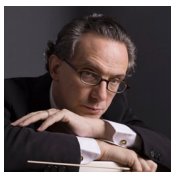
Fabio Luisi Chairman of the jury Chief Conductor, Danish National Symphony Orchestra