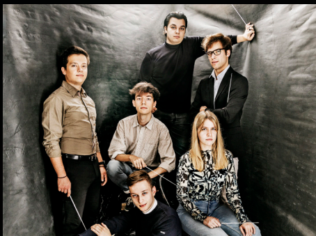
Malko Academy for Young Conductors, class of 2024